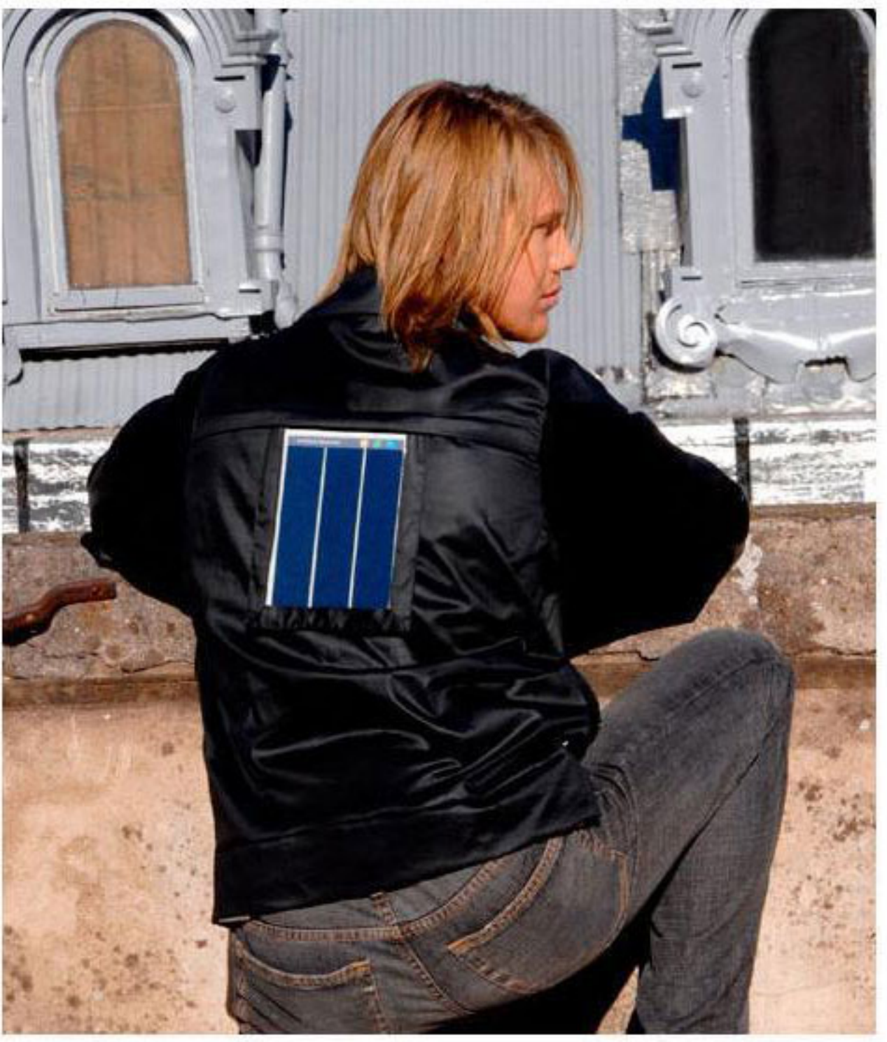
Indarra DTX is a small design firm based in Buenos Aires that's experimenting with technologies applied to fabrics and different kinds of materials in modern clothing.

Solar Jacket and Tech Clothes, by Indarra DTX in Argentina by Paula Alvarado, Buenos Aires on 06. 3.08 FASHION & BEAUTY 2 diggs digg it submit Buzz up! Share this