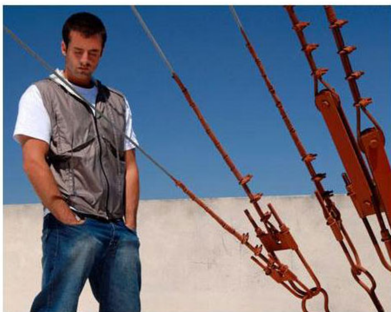
Indarra DTX vest.

The vest pictured below has a stain resistance finish that blocks the absorption of liquids, including oil. This finish doesn't interfere with the fabric's ability to 'breathe', and keeps the fabric looking like new for longer. It's also suitable for light rain, and can be reduced to fit in one of its pockets, which makes the vest easy to transport when traveling.